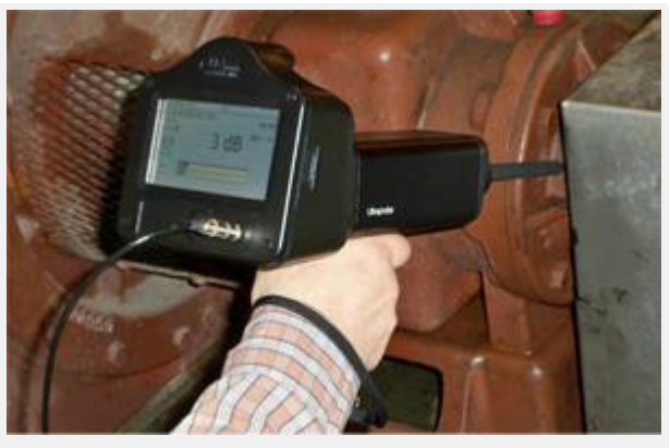
Figure 1. Utilize ultrasound as the primary tool for monitoring bearing condition.

very well together in a predictive maintenance program , says Jason Tranter, managing director of <u>Mobius Institute (www.mobiusinstitute.com</u>). "However, due to the cost and skill requirements involved with vibration analysis, it can be difficult to test the plant's rotating machinery frequently enough to provide the earliest warning of a fault condition," he warns. "One solution is to provide operators with an ultrasound tool to scan machines on a more regular basis. If there is a change in the sound emitted by the machine, the operator can call in the vibration analyst to perform additional measurements so that a detailed assessment of the potential problem can be made. Routine vibration measurement should still be performed to detect any problems not detected by the ultrasound tool, but this strategy reduces the likelihood of fault conditions will be missed."