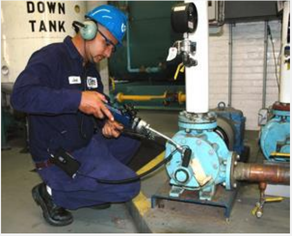
program is going to find themselves in the Figure 6. When applying grease to bearing on best position to reduce energy waste, reduce a pump, apply a little at a time and observe greenhouse gas emissions, eliminate the meter for a dB drop.

greenhouse gas emissions, eliminate equipment failure, increase production and safety, and decrease downtime."